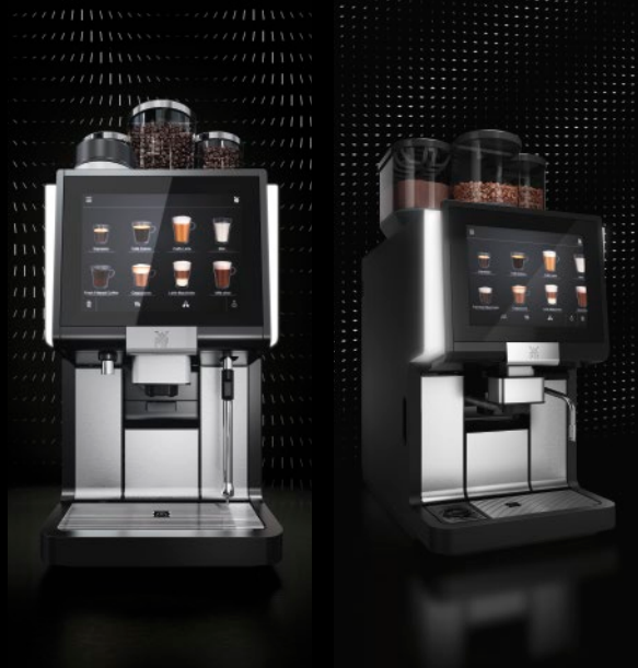
WMF 5000 S+