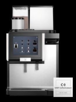
WMF 9000 F (Internal Storage)

The availability of WMF CoffeeConnect with all standard and extra features as well as additional tools depends on the country, machine type and software version and is continuously being extended. Additionally, some features and tools may only be used with the relevant authorisation.